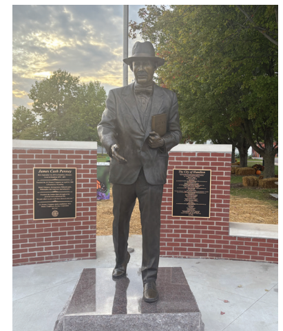
Mr. Penney Statue