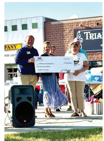
JCPenney Communities Foundation presented $10,000 to the Homestead Museum