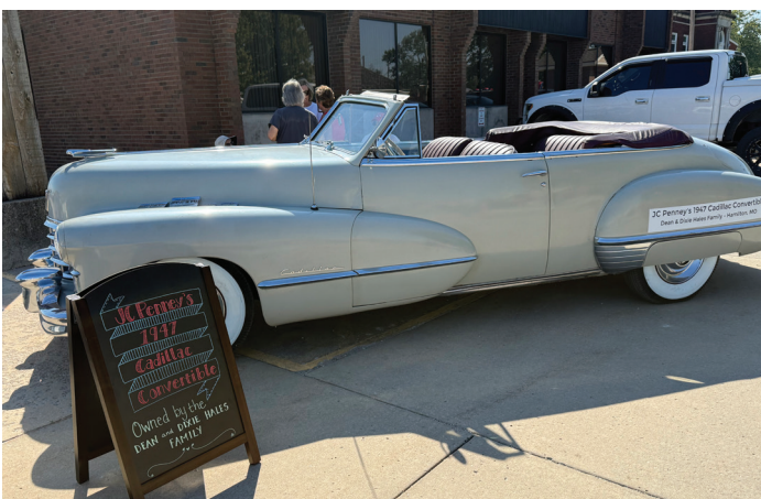
Mr. Penney's Cadillac

We thank the grandchildren of Mr. Penney, the many H.C.S.C. Alumni Club members and Regional Meeting Groups and other outside donors whose generous donations along with numerous Hamilton organizations and the J.C. Penney Memorial Library and Museum Trust for making this historic project possible!