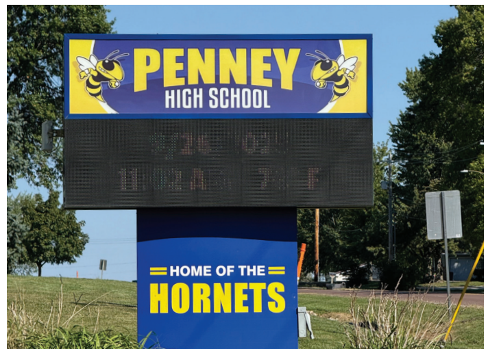
Penney High School