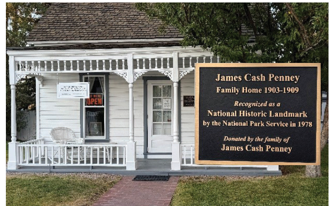
The Homestead with plaque insert