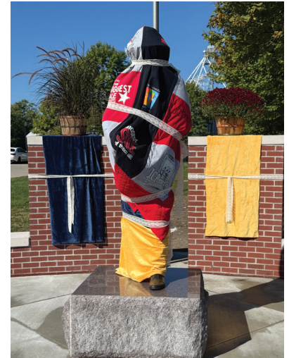
Statue wrapped in quilts

The Penney Quilt Store, formerly JCPenney Store #500, was open for business and attendees could immediately recognize the polished wood floors and 2nd floor mezzanine style of store for that era. Store #500's number was personally selected by Mr. Penney. It celebrates its 100th anniversary this year! This quilt store still has the original yellow and black JCPenney Store sign displayed on its interior.