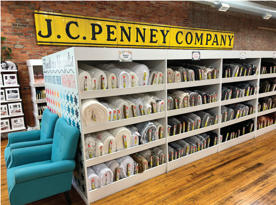
Store #500, now a quilt store