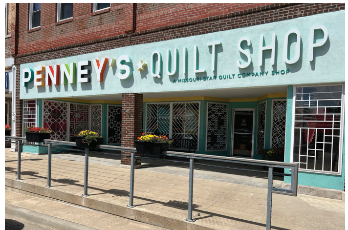
Hamilton is a popular destination for quilting supplies