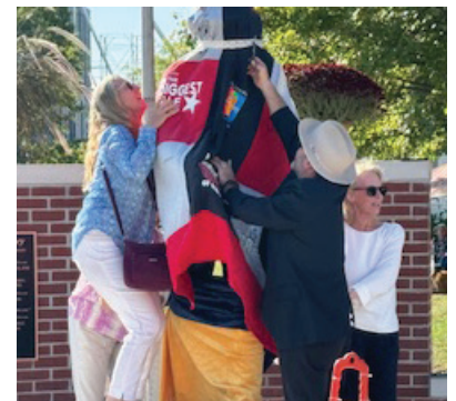
Unveiling the statue