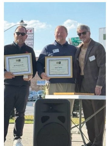
Construction team appreciation