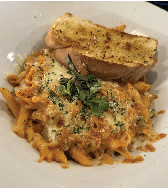
JC Penne served at Pasta Villa restaurant