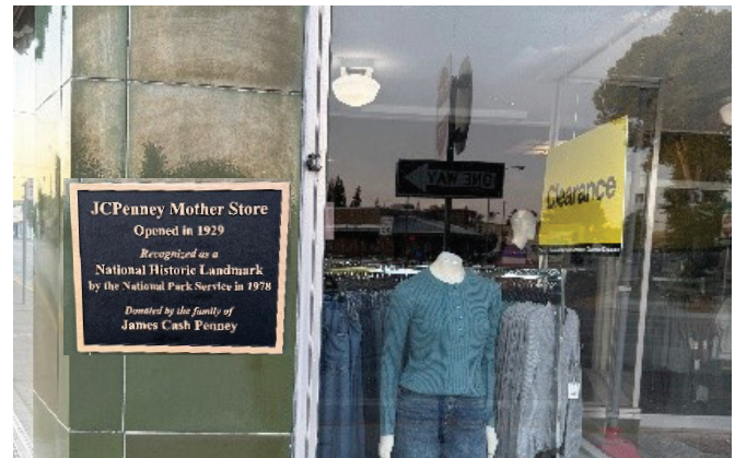
Mother Store with plaque