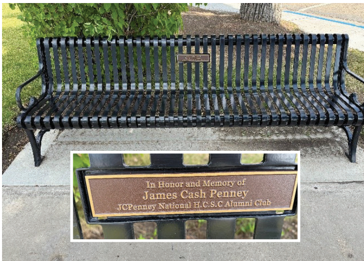
Park Bench at Triangle Park