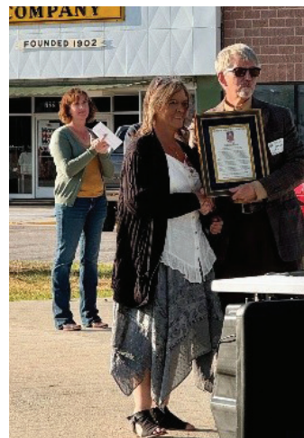
City of Kemmerer Golden Rule Community Award