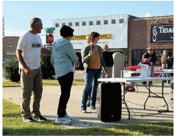
City of Kemmerer Golden Rule Community Award