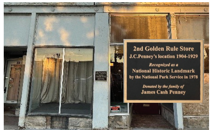
2nd Golden Rule Store