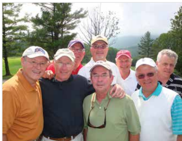
Golf Trip in Asheville with JCP Buds