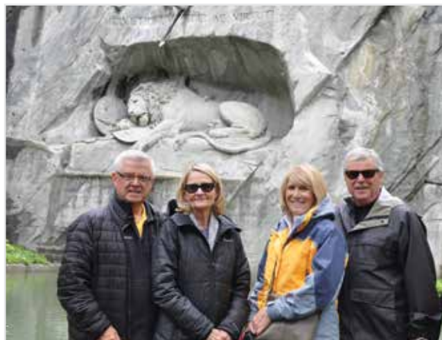
At the Lion Monument in Lucerne